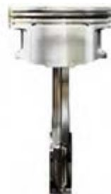
MAGMA SYN RNL 5W-30