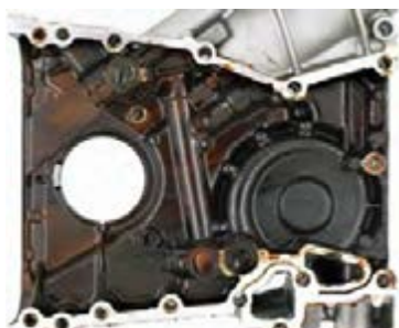
Comparative API SN oil