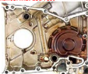
MAGMA SYN ULTRA 5W-40