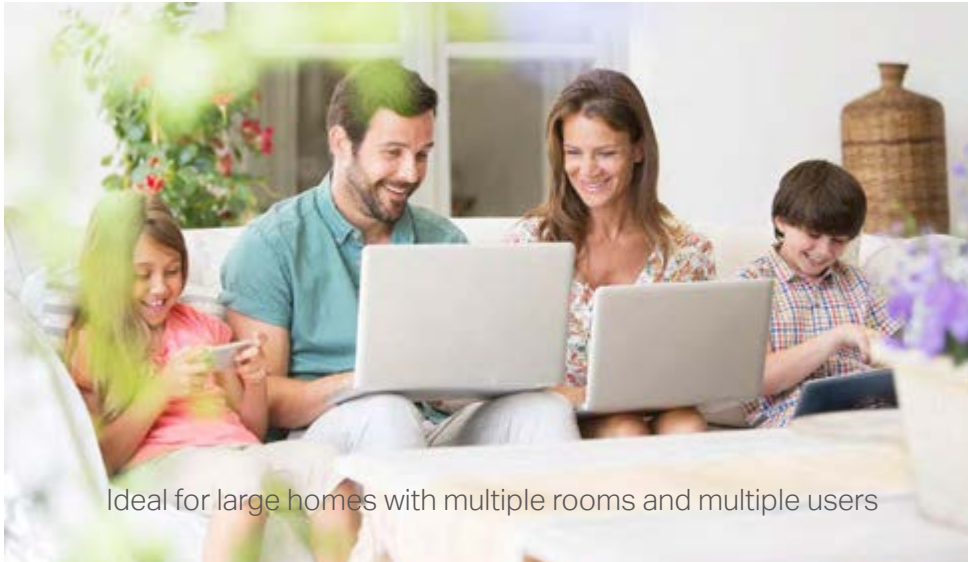
Ideal for large homes with multiple rooms and multiple users