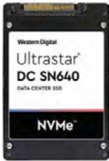
2.5-inch U.2, 7mm, NVMe SSD 800GB, 1.6TB, 3.2TB, 6.4TB, 960GB, 1.92TB, 3.84TB, 7.68TB 1