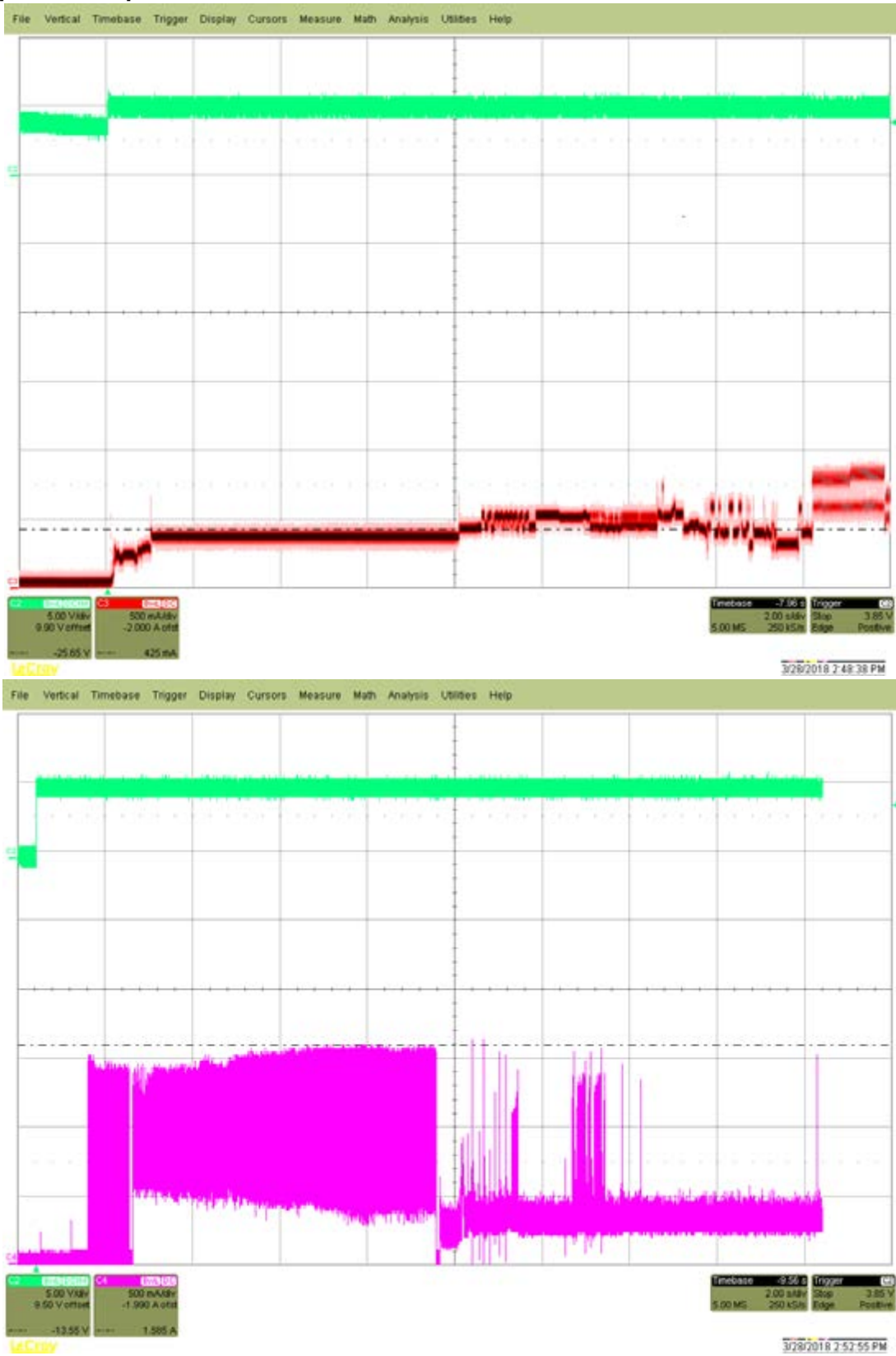
Figure 1. Typical 5V and 12V startup and operation current profiles