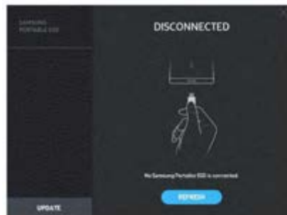
Example of error message

"No Samsung Portable SSD is connected." message appears even though the Samsung Portable SSD Software has been installed on the device running macOS