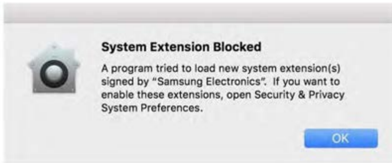
Example of error message

A "System Extension Blocked" message appears when installing Samsung Portable SSD Software