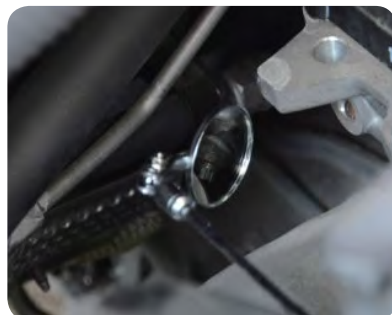
38 mm Diameter Inspection Mirror

To inspect hidden or narrow areas Double ball joint links swivel mirror for viewing to 360°