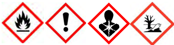
GHS02 GHS07 GHS08 GHS09