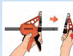
Conversion to spreading