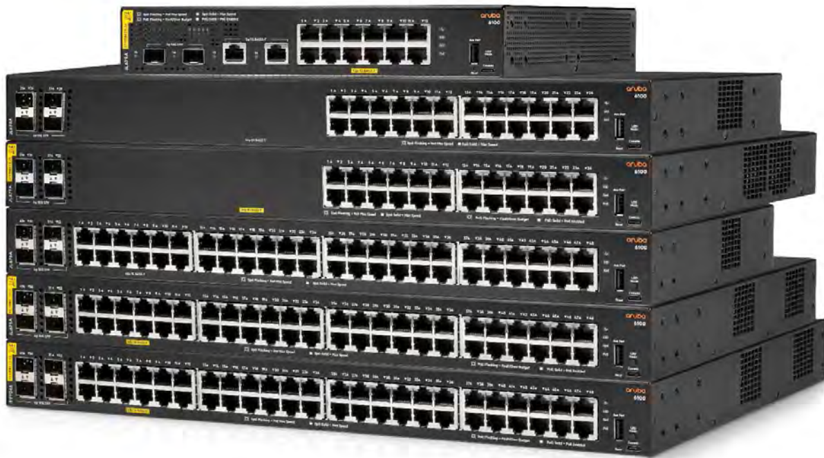
HPE Aruba Networking CX 6100 Switch Series

The HPE Aruba Networking CX 6100 Switch series supports management choices that include Web GUI, CLI, cloud-based and on-premises Aruba Central, so you can choose the best fit for your needs today with flexibility to change without replacing hardware. With enhanced access security, traffic prioritization, and IPv6 support, the HPE Aruba Networking CX 6100 Switch series also simplifies ownership and brings peace of mind with switch software embedded with no subscription required to enable and a Limited Lifetime Warranty.